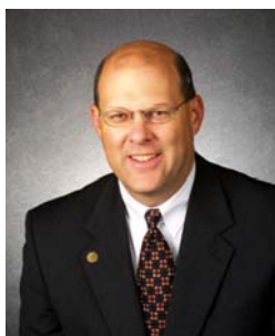
From the Executive Secretary

Traditionally, fall is the time of year when the vast majority of people think about students “heading back to classrooms.” This annual ritual includes not only school-aged children, but also young adults returning to college and university campuses across the country.