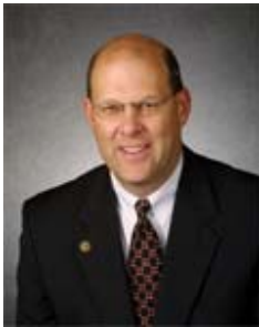
From the Executive Secretary

On Thursday, November 18, 2010, the Educational Approval Board (EAB) will hold its 12 th Annual Approved Schools Conference at the Sheraton Madison Hotel. “Quality Schools = Student Success” is the theme of this year’s conference and will examine the important relationship between quality-focused schools and positive student outcomes.