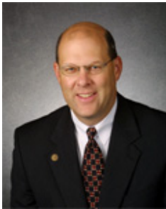
From the Executive Secretary

In the United States and in many other countries, January 1 st is recognized as the beginning of the New Year. Yet in the world's most populated country, China, February 7 is the first day of the New Year.