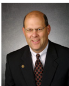
From the Executive Secretary

Earlier this year, a new strategic plan was adopted by the Educational Approval Board (EAB). In the last newsletter, I listed the plan's six strategic goals – one of which is to position the EAB so that it is actively involved in postsecondary education policy decisions. In addition, I mentioned that the EAB's strategic plan is a living document and is an integrated part of our day-to-day work.