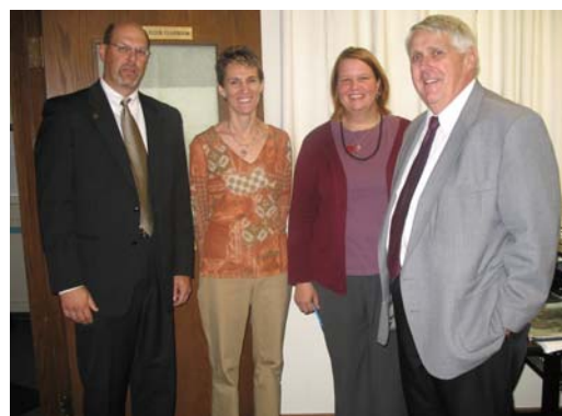
Tour of Lakeside School of Massage Therapy