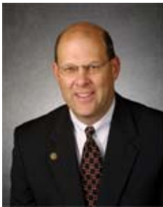
From the Executive Secretary

The Educational Approval Board (EAB) will be holding its annual approved schools conference on November 9. Although time is running out, you still have an opportunity to register. Information about registering can be found in this newsletter or by visiting the EAB's website.