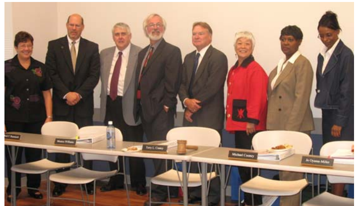
EAB staff and board members at Kaplan College (left to right)

Check the EAB website in early December for further information about the meeting.