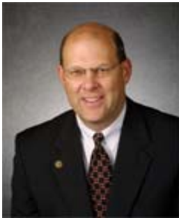
From the Executive Secretary

Those who regularly read this newsletter, and in particular this column, know that the past several issues have spent time talking about ways the Educational Approval Board (EAB) can move from an oversight model based on compliance to one based on school advancement and accountability for student results.